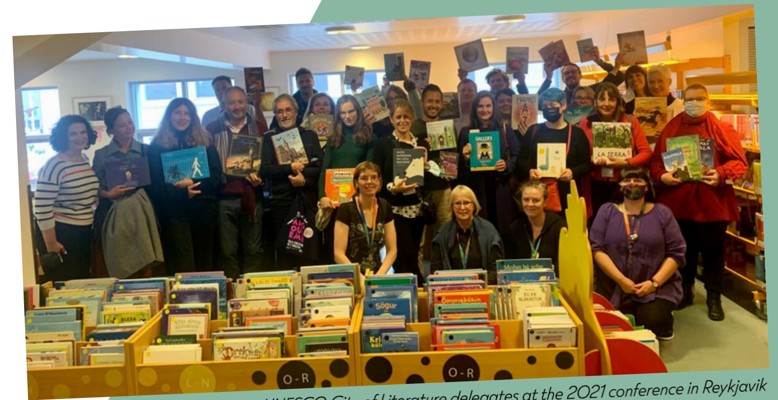
UNESCO City of Literature delegates at the 2021 conference in Reykjavik

Applicants may be required to undergo a DBS check.