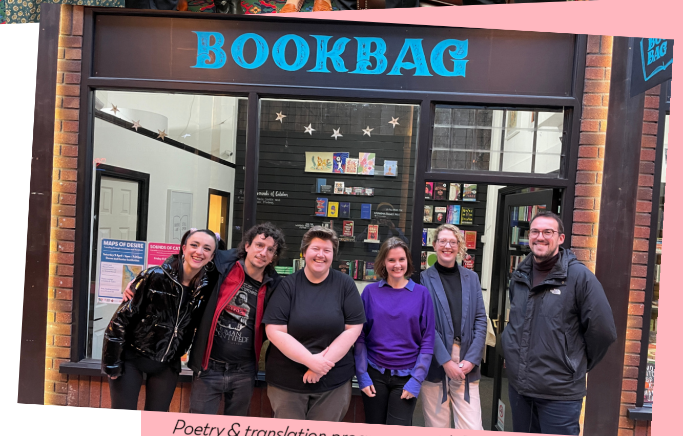
Poetry & translation programme with Barcelona UNESCO City of Literature, the Devon & Exeter Institution, and Bookbag