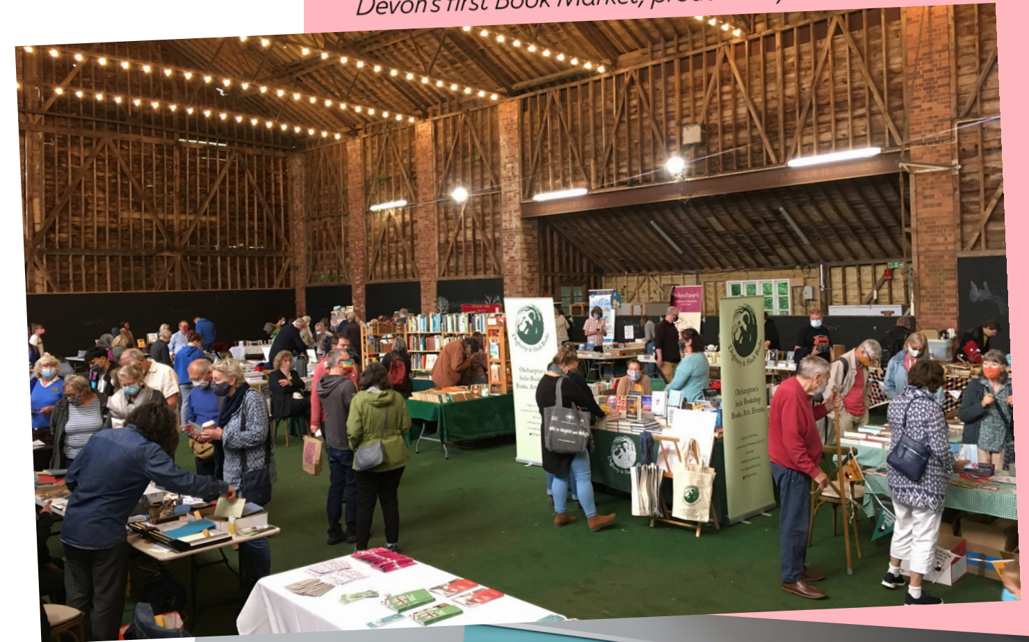
Devon's first Book Market, produced by ExCoL June 2021