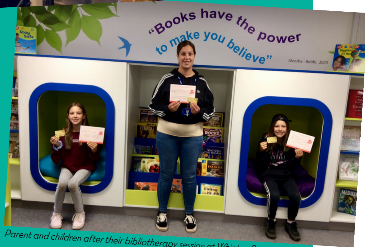
Parent and children after their bibliotherapy session at Whipton Barton School

If you would like to receive any of these materials in an audio file or via BSL, please email hello@exetercityofliterature.com